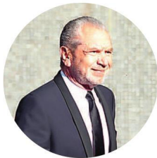
LORD ALAN SUGAR

Lord Alan Sugar, who lives in Chigwell, was once renowned as the owner of Tottenham Hotspur but is now best known for his appearances on The Apprentice , demonstrating his commercial nous. A self-made billionaire, he received a life peerage in 2009 and became enterprise champion to the business secretary seven years later.