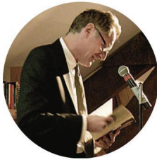
SIR ANDREW MOTION

Poet Andrew Motion spent his childhood in Stisted, near Braintree. In 1999, Motion started a 10-year run as Poet Laureate. He wrote for the Salvation Army about homelessness, the TUC about liberty and for Childline about bullying. He also founded the Poetry Archive, an online library of poets reciting their work. Post-laureateship, he became president of the Campaign to Protect Rural England.