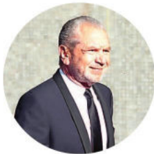
LORD ALAN SUGAR

Lord Alan Sugar, who lives in Chigwell, was once renowned as the owner of Tottenham Hotspur but is now best known for his appearances on The Apprentice , demonstrating his commercial nous. A self-made billionaire, he received a life peerage in 2009 and became enterprise champion to the business secretary seven years later.