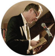
SIR ANDREW MOTION

Poet Andrew Motion spent his childhood in Stisted, near Braintree. In 1999, Motion started a 10-year run as Poet Laureate. He wrote for the Salvation Army about homelessness, the TUC about liberty and for Childline about bullying. He also founded the Poetry Archive, an online library of poets reciting their work. Post-laureateship, he became president of the Campaign to Protect Rural England.